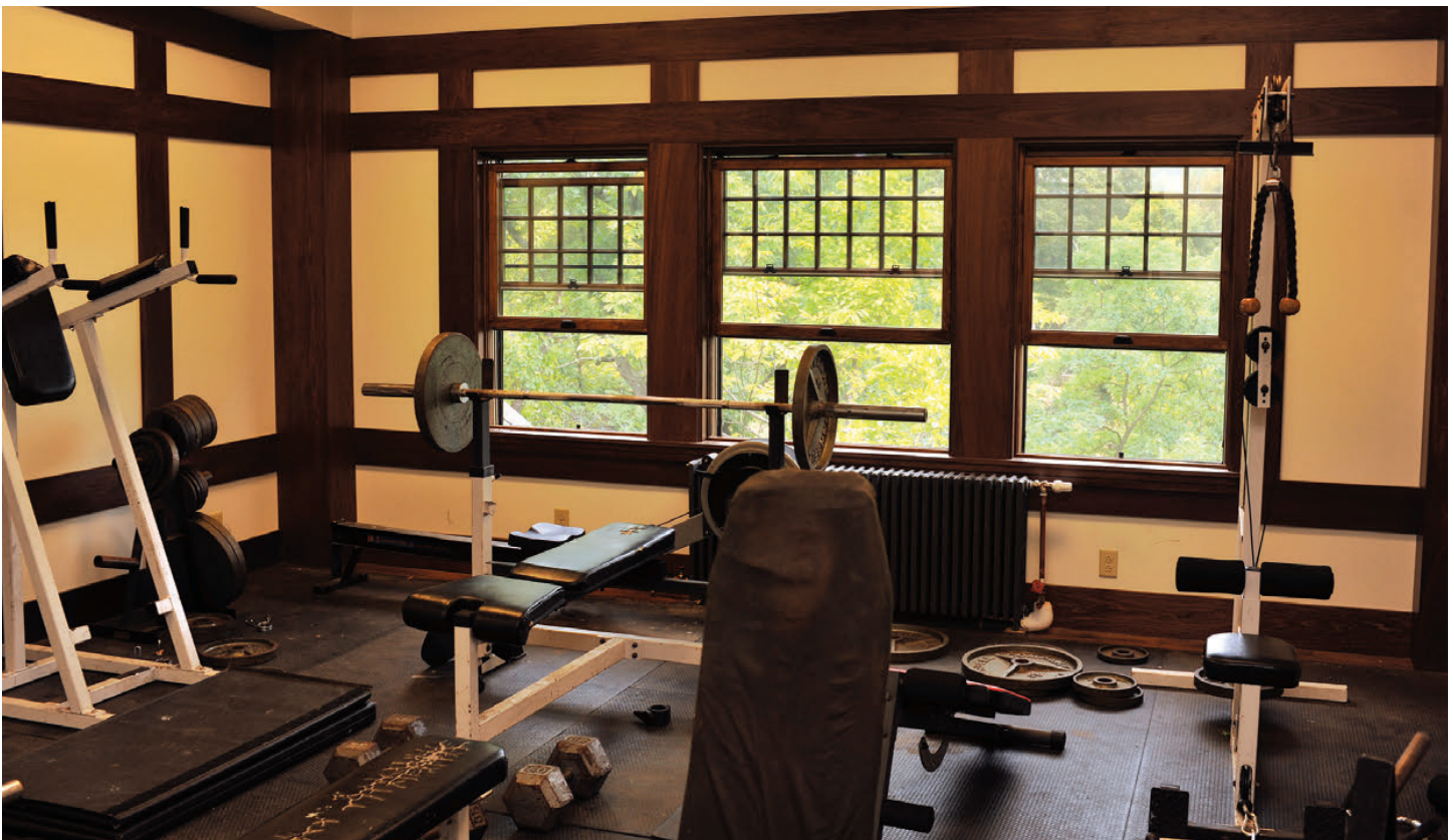
The new third floor fitness center