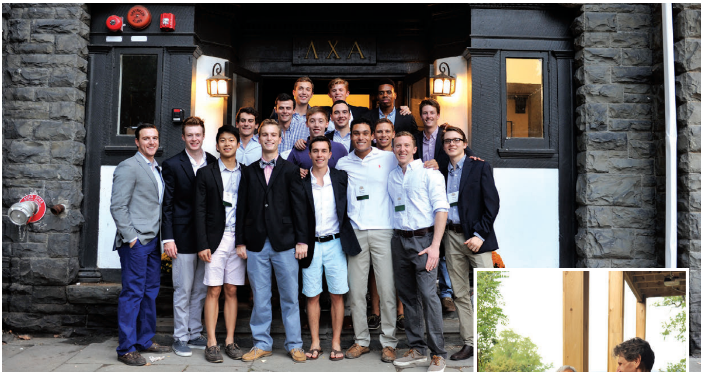
The undergrad brothers welcome visiting alumni