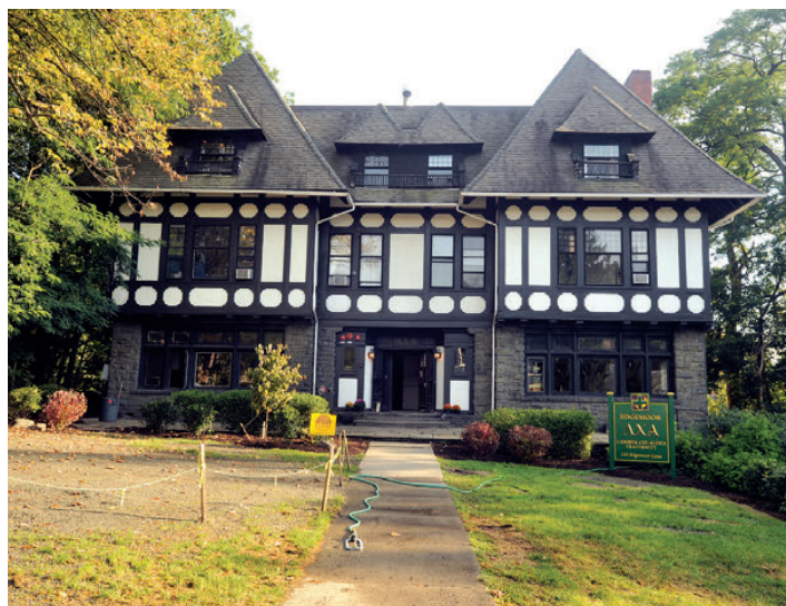
Edgemoor's new landscaping, sign and front lawn