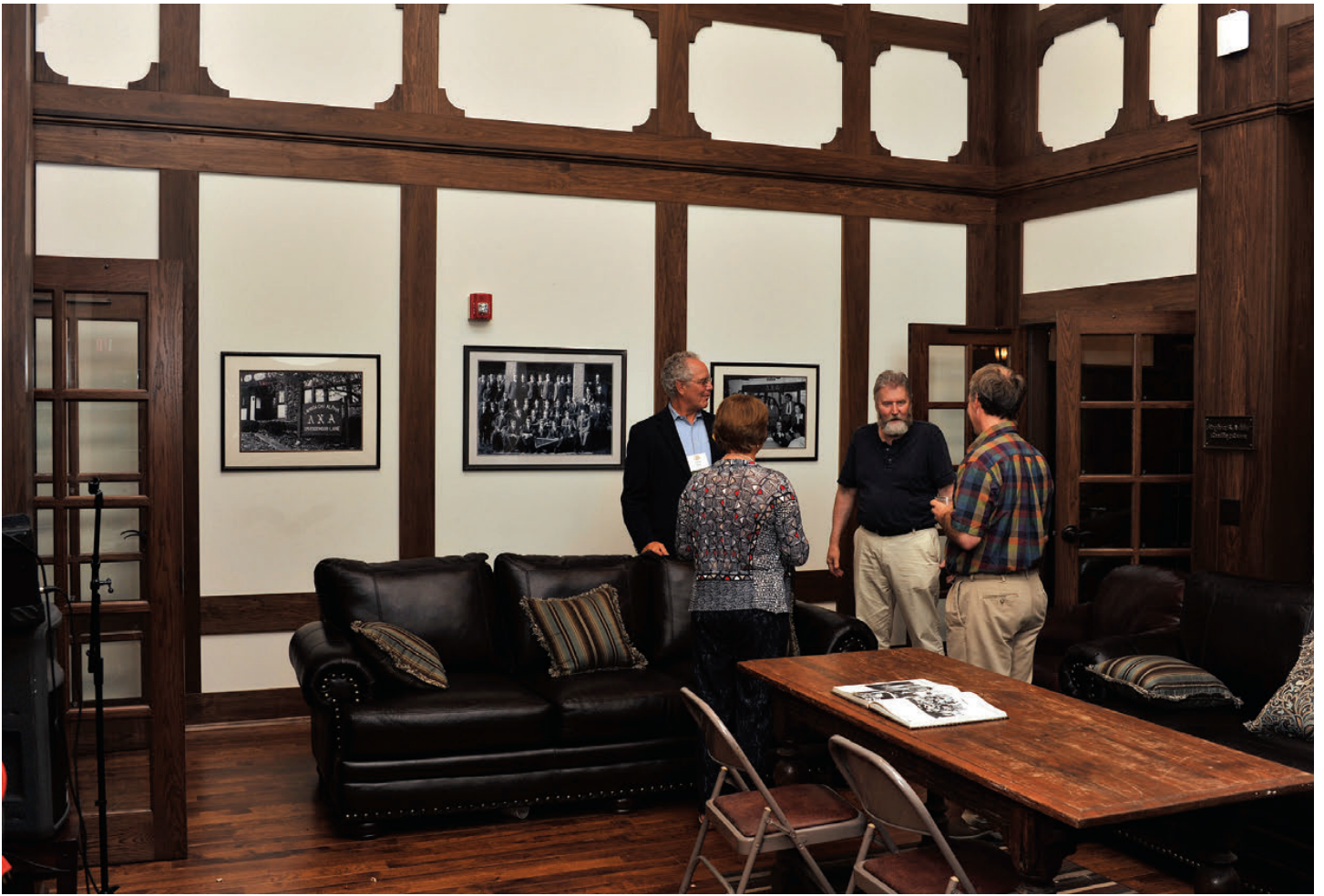
Alumni touring the new two-story Ashley Reading Room