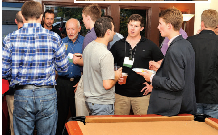
Socializing at the post-game wine and cheese reception