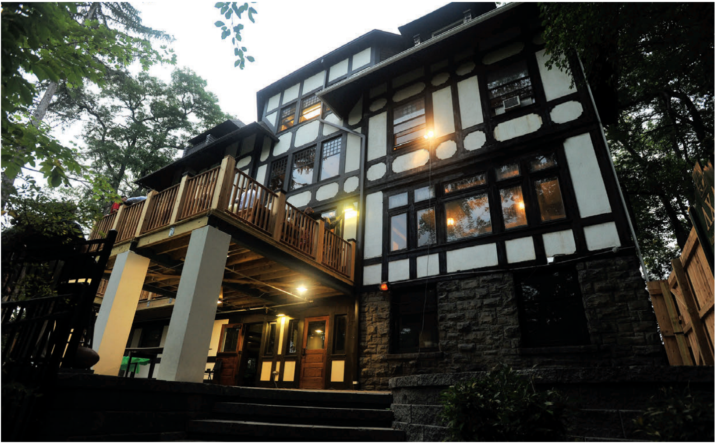
Edgemoor at twilight