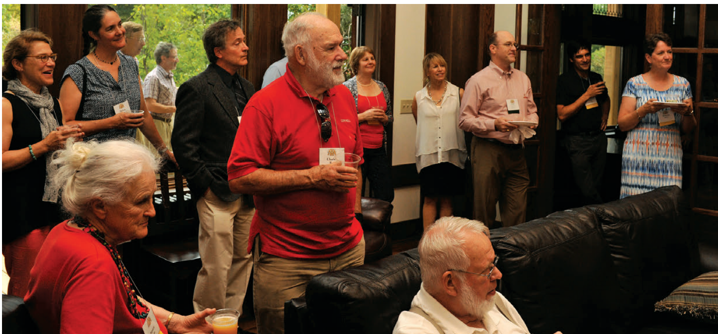
Alumni listening to the Renovation Presentation.