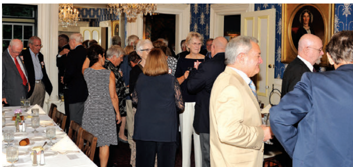
'50-'60s era alumni gather at Taughannock Farms Inn for Friday dinner