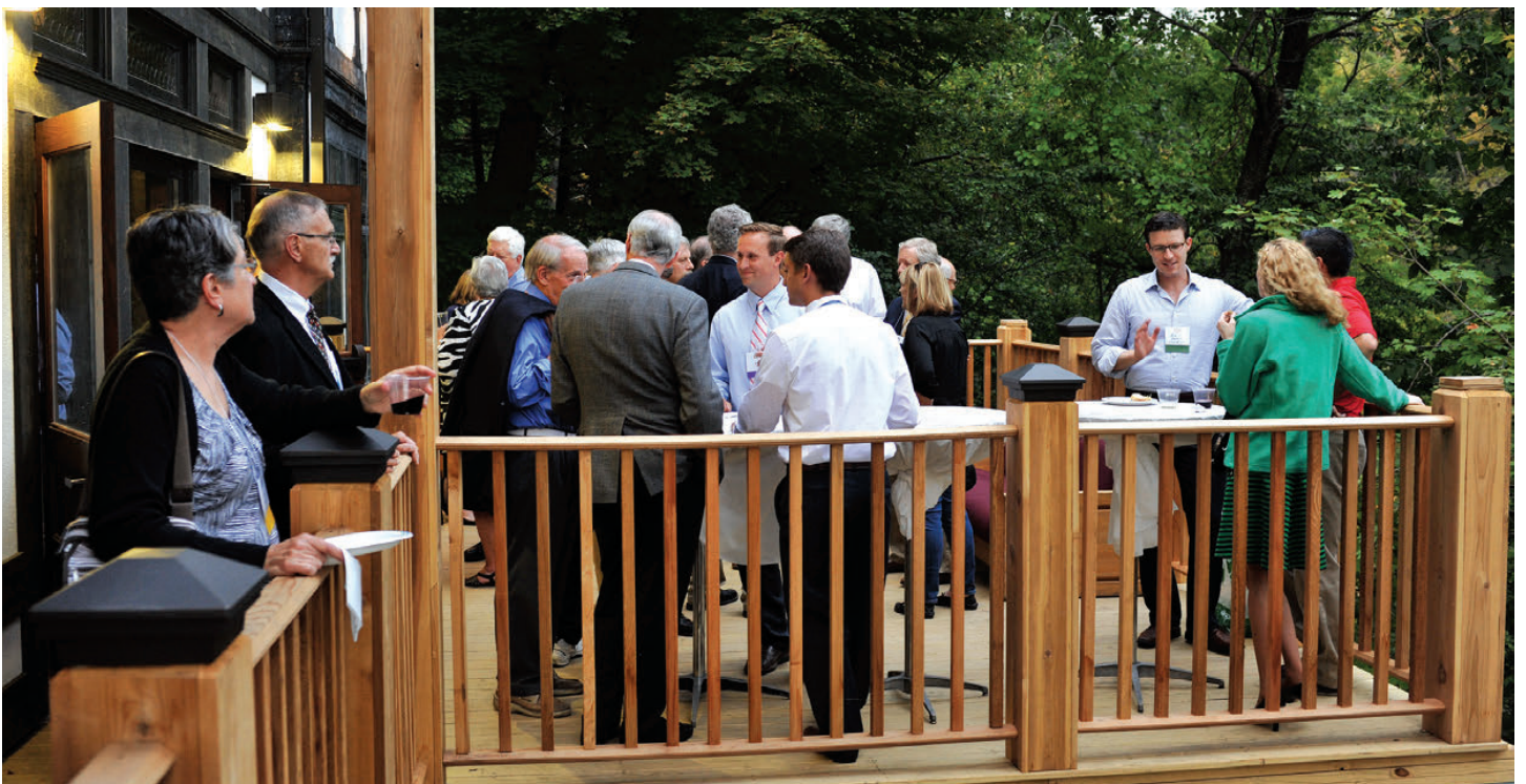
Alumni socializing on new rear balcony