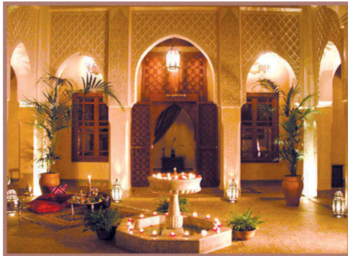
Lobby Riad Kniza Hotel

Unlike magazines and blogs, I don't have a "top ten" list for you. There are a handful of hostelrys we will never forget, some visited many times.