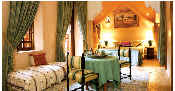
Room at Riad Kniza Hotel

Four blocks past a chaotic market, behind a somber stone wall on a dimly lit and vaguely menacing street, there is an ancient and massive wooden door. Inside is an oasis of luxury and calm and perhaps the warmest and most sincere hospitality we have ever experienced. Welcome to Riad Kniza in Marrakech. If you choose to dine there (and you should), at breakfast they will ask you what you would like for dinner-and they go to the market to fulfill your request. The owners, second and third generation antique dealers, fill their home-and your rooms-with one of a kind furniture and art work. Some antiques, and quality reproductions, are available in their shop several miles away in the French Quarter.